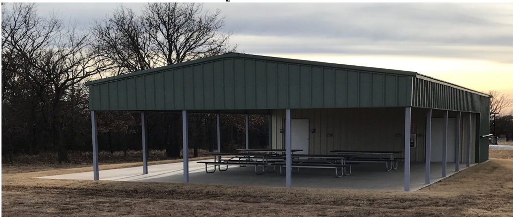
OKC Gun Club Family Pavilion

We are pleased to announce the completion of our OKC Gun Club Family Pavilion, located just inside the main entrance. The Pavilion can accommodate up to 60 people and is free for member's use and other approved events, family reunions, picnics, training, etc. This facility is equipped with ADA-compliant heated restroom, picnic tables, folding tables/chairs, wash sink and other support items. Club member Michael Tupps manages and handles the scheduling of the facility, he can be reached at mjtupps@gmail.com or (918) 605-5696 .